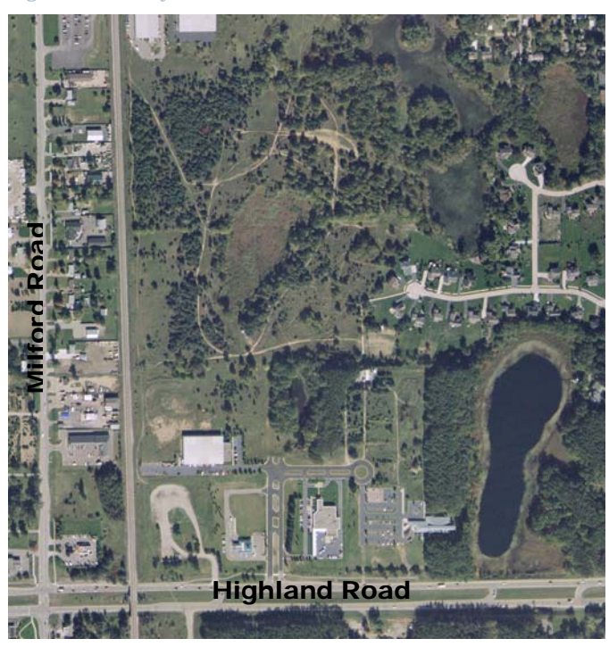
Figure 6: Downey Lake Park