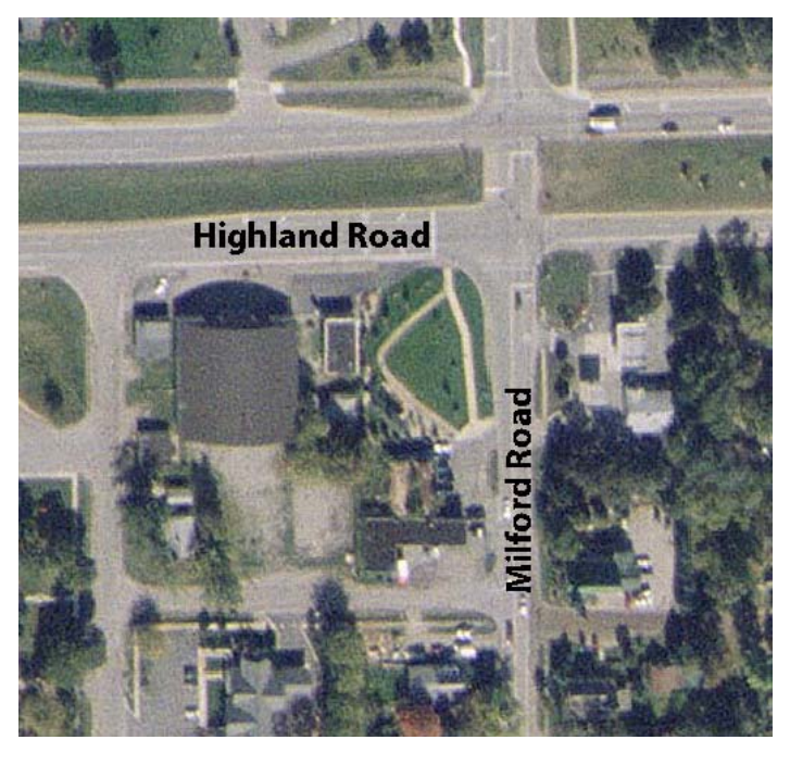
Figure 5: Highland Station Park