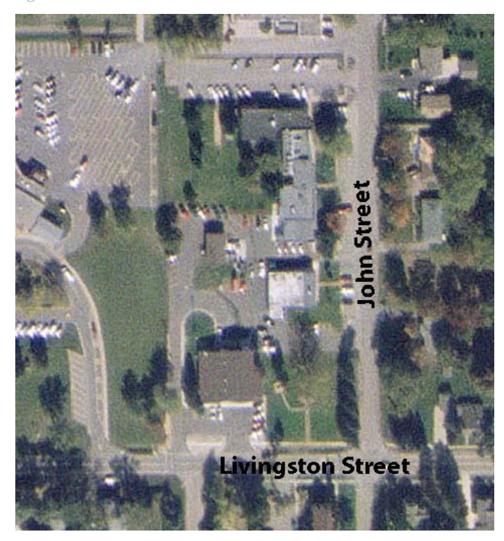
Figure 4: Veteran's Park